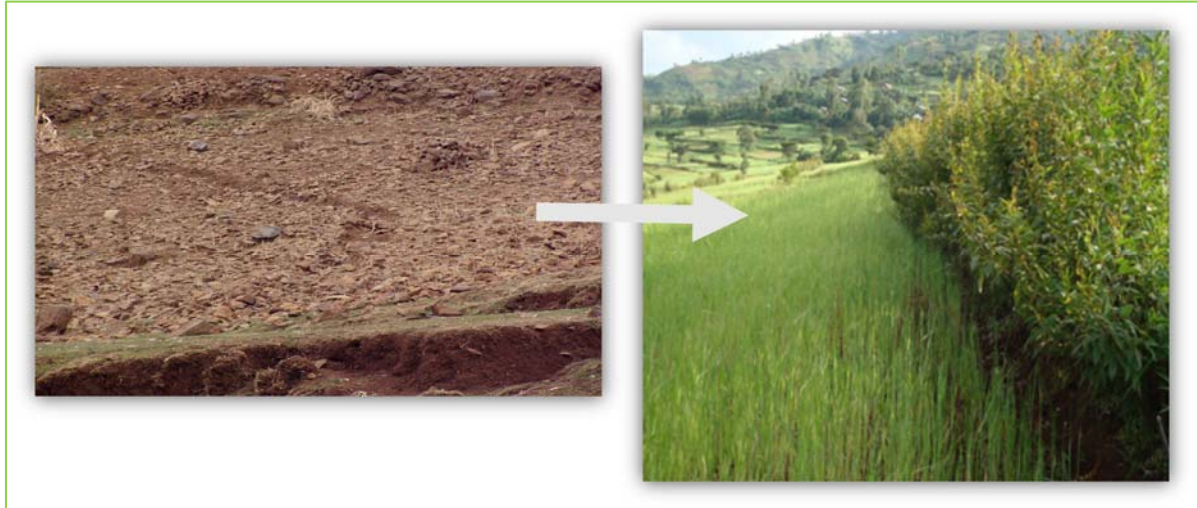
Figure 1: Degraded and restored landscapes

Jimma and Cornell Universities join hands in developing climate smart Programs in Ethiopia using US Embassy's seed grant