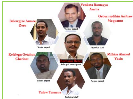
Figure 3: Jimma University research team

The main objective of this Climate Smart Program in Ethiopia is, by repeatedly taking samples at different time intervals from different sites in Ethiopia, to measure whether the interventions had relevant impact on the landscapes in terms of mineral composition, soil fertility, and moisture content and to report the result to policy makers.