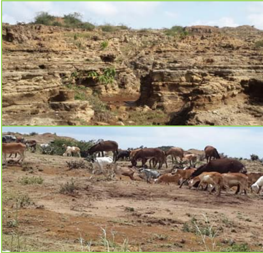
Figure 2: Examples of extremely degraded and highly overgrazed landscapes in Ethiopia

Land degradation is the reduction in the capacity of the land to provide ecosystem goods and services and assure its functions over a period of time for its beneficiaries.