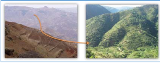
Figure 6: Jimma and Cornell conducted soil carbon sequestration and soil fertility assessment of PSNP projects across 6 Ethiopian regional states as part of the climate smart initiative consortium working under CARE-Ethiopia consortium

The project was developed to achieve seven objectives. Four of them are: (i) strengthening the two arms (PSNP & HABP) of the food security program in Ethiopia by making them more climate smart, (ii) assessing the various best management activities in light of climate change and low-carbon livelihoods, climate change adaptation and mitigation, (iii) collecting primary data from PSNP sites on soil and biomass carbon and other climate-smart sustainable land management indicators, and (iv) modeling and predicting potentials for carbon sequestration and to allow monitoring verification and reporting of carbon stock changes.