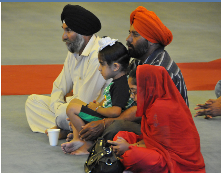
A family worships in the Tierra Buena Sikh temple in Yuba City, California.

The Punjabi-American Festival, held each year on the last Sunday in May, is organized by the Punjabi-American Heritage Society, which was founded in 1993 to encourage cross-cultural understanding in the community. The festival is a secular celebration of Punjabi food, film, music and dance.