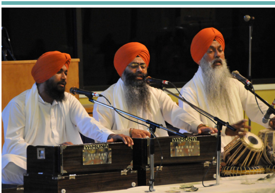
Singers perform traditional kirtan , hymns taken from the Sikh holy book, at the Tierra Buena temple.